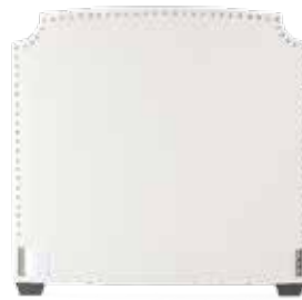
Headboard with Nailheads