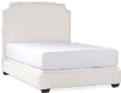
Bed with Nailheads